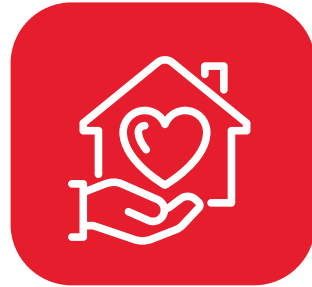
How you can help at home